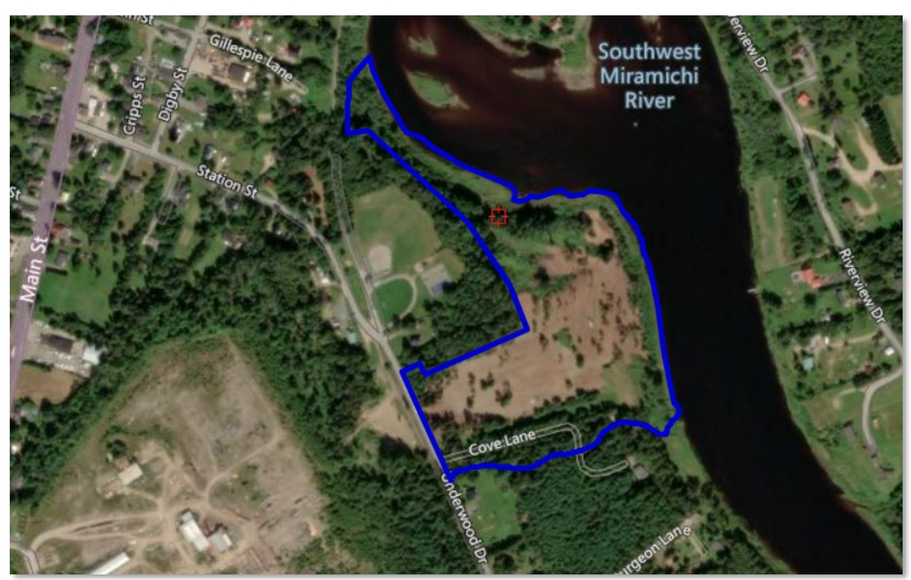
Figure 2: Aerial Image locating subject property outlined in blue.

When considering this application (see overview in table 1 below), PRAC may approve, approve with conditions, or deny the requested variance.